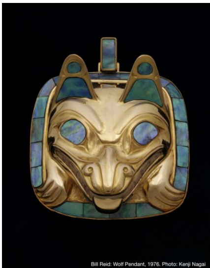
Bill Reid: Wolf Pendant, 1976.

There are so many ways to explore Indigenous culture in British Columbia! In addition to many groundbreaking galleries and museums, Indigenous artists from across the province continue to produce and collaborate on an incredible array of works. Discover a way to connect with Indigenous culture in your community today!