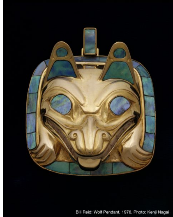
Bill Reid: Wolf Pendant, 1976.

Make this gallery your favourite place in Vancouver to buy local art, individually made craft pieces, and gifts for everyone you know.