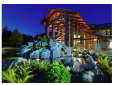
PLACES TO STAY + EAT

Exploring BC's Guide to Arts and Culture recommended destinations gives guide users a curated, authentic experience of the best of BC.