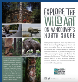
TWO PAGE FEATURE