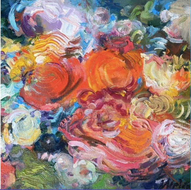
Jazzy Blooms, 8"x10", oil on canvas

Known for her lyrical brushwork and expressive use of colour, Jane Appleby's work intimates an emotional, unique abstraction of her landscape subjects. Often painting on location, her work is found in a number of galleries, and in exhibitions throughout the region. Currently showing at the The Federation of Canadian Artist's Gallery in Vancouver, and group show exhibition-"A New Perspective" at the Loyd Gallery, Penticton, April 2020.