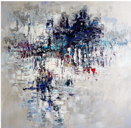
Paul Ygartua Studios | Vancouver

CLICK HERE TO VIEW ART-BC RECOMMENDED ARTISTS