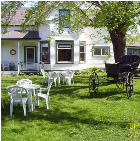
Baillie House | Merritt, BC

Be sure to stay and explore the community for an afternoon or overnight stay. #explorebcc