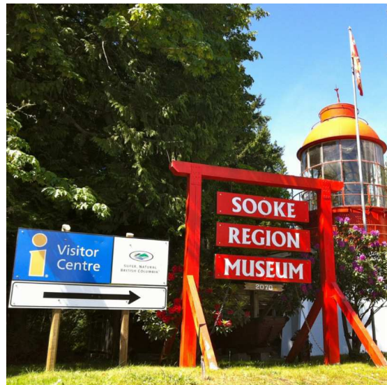
Sooke Region Museum | Sooke, BC

Merritt Tourism is the heart of the Nicola Valley. Whether you're traveling to or travelling through the City of Merritt, the Merritt Visitor Information Booth at the Baillie House is a great location to start your visit. You can find Merritt tourism