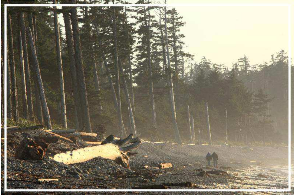
Agate Beach

Haida Gwaii is perhaps the most remote part of British Columbia's North. It is here, in a place where roads cannot deliver you, that the warmest of welcomes awaits. Formerly known as the Queen Charlotte Islands, Haida Gwaii literally translates as "Islands of the Haida people," an archipelago on the North Coast of British Columbia, Canada.