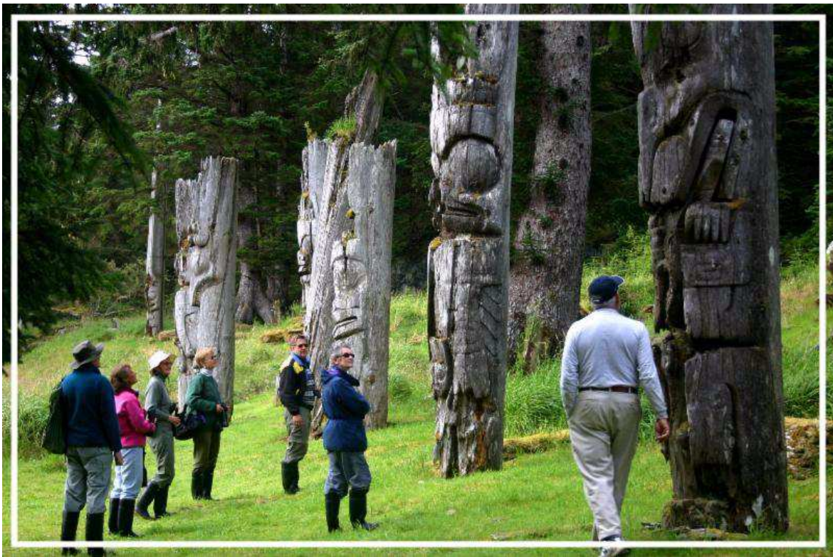
Sgang Gwaay, Haida Gwaii