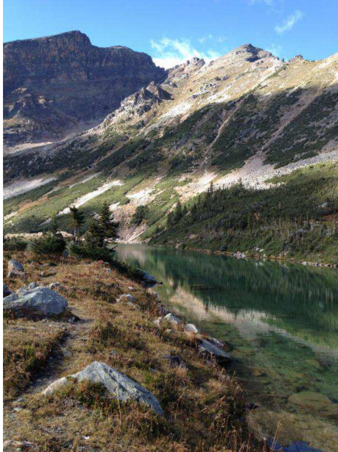
Gorham Lake Trail.

Post your photos from the Kootenays and beyond with