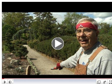
Ikeda Japanese Garden 199 Marina Way (behind the Penticton Art Gallery)