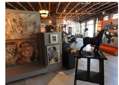
Martin St. Gallery 205 Martin St