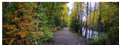
Mission Creek Greenway

One of them is the Mission Creek Greenway, a meandering 17 km corridor for cyclists and pedestrians along the banks of Mission Creek in the southern part of the city. It's a great spot to see spawning Kokanee salmon, explore some spectacular landscape features, and enjoy the fall foliage as the giant cottonwood trees change colour. It's an easy, level walk for most of its length.