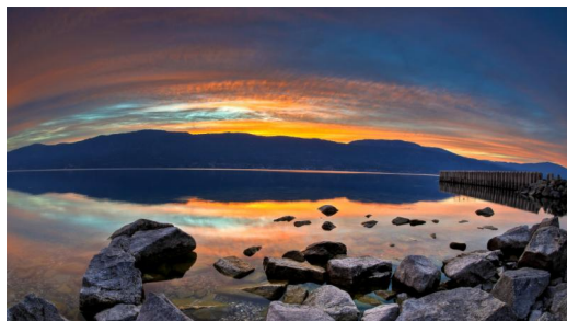
Sunset on Lake Okanagan

reserve my deepest affection for the landscape - its shape and form, colour, fragrance, and fundamental fragility. These are indelibly etched in me by now, and even though I am still moved by Saskatchewan's 'living skies,' it's the sun-baked scent of dry pine needles and the dusty blue colour of the Okanagan hills at sunset that means 'home.'