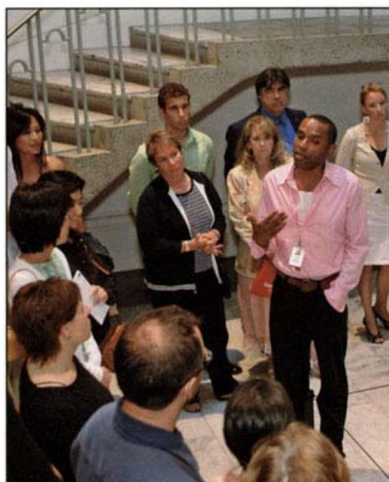
One of the BC Cultural Crawl tours held at the Vancouver art Gallery.

Ultimately, the most important key is to put the power in the community's hands. M