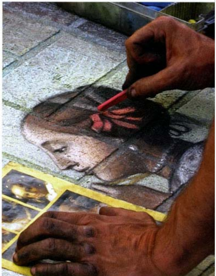
Pavement Art in BC.