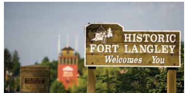
Fort Langley, BC