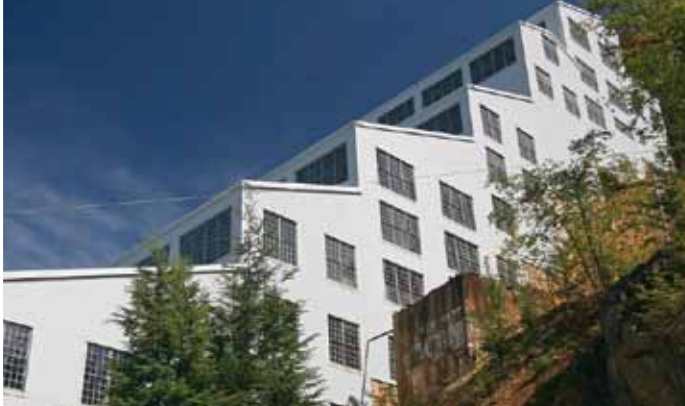
Britannia Mine Museum