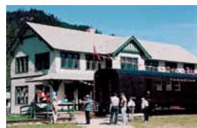
West Coast Railway Heritage Park, Squamish

When communities preserve their heritage they steward their story. Throughout British Columbia you will find local museums, cultural centres and historic sites that help trace the history of Canada's far western province. Though British Columbia is young, its history is rich. From the U'mista Cultural Centre in Alert Bay and the Ksan Historical Village and Museum in Hazelton (page 124), to "Big House" at Fort Langley where the Father of British Columbia, James Douglas, proclaimed the establishment of British Columbia and the recently restored Britannia Mine Museum (page 35), the characters from BC's past have touched all corners of this province.