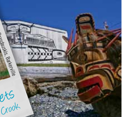
U'mista Cultural Centre, Alert Bay

The best of the country lies well off the beaten path. To create memories that last a lifetime, get in the car or borrow a bike, and follow the country roads as far as your feet will take you. One of BC's best-kept secrets is its circle farm tours . Consider taking a spin on the original Agassiz-Harrison route (near Harrison Hot Springs) where Farm House Natural Cheeses offers you a view of the cheesemaking process and a taste of pure country – artisan cheeses and dairy products made with pure milk from the cows and goats right on their family farm.